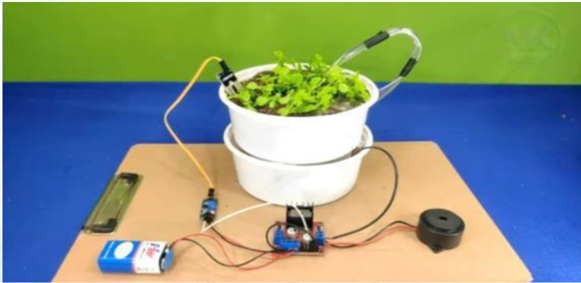
Fig 2: Experimental Setup

The 9V HW battery provides power to the motor driver and the DC motor. The motor driver's input terminals are connected to the sensor output, and the motor driver's output terminals are connected to the mini motor. Jumper wires are used to establish connections between the battery, motor driver, moisture sensor, and DC motor. The absence of a microcontroller simplifies the design, relying on the soil moisture sensor's direct output to control the watering process.